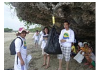
Beach clean-up of Olango Island

We put great effort into volunteer community clean-ups at each TAIYO YUDEN Group site. These activities are not restricted to Japan; in 2012 in the Philippines we carried out a beach clean-up of Olango Island and collected 81 kg of garbage that had washed ashore.