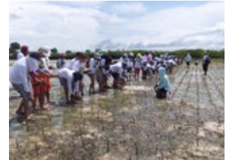
Mangrove tree planting

In FY2008, TAIYO YUDEN (PHILIPPINES) began planting mangrove seedlings on Olango Island, near Mactan Island where the company is located. Every year 10,000 mangrove trees are planted.