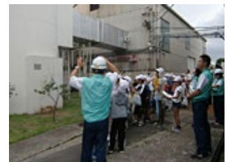
A plant tour

The TAIYO YUDEN Group accepts plant tours as one important way of keeping in contact with local communities. TAIYO YUDEN Mobile Technology was visited by about 80 elementary school students and about 20 high school students who were then briefed on the corporate activities of the TAIYO YUDEN Group and the products made at the plant. University students visited TAIYO YUDEN (PHILIPPINES) and learned about the practice of environmental protection technologies. Moreover, 40 representatives from 28 groups also paid a visit and toured the safety practices in the workplace.