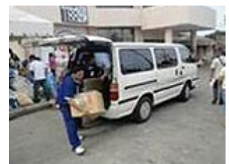
Donations to the victims of Typhoon Pablo