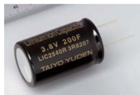
Cylinder type lithium ion capacitors