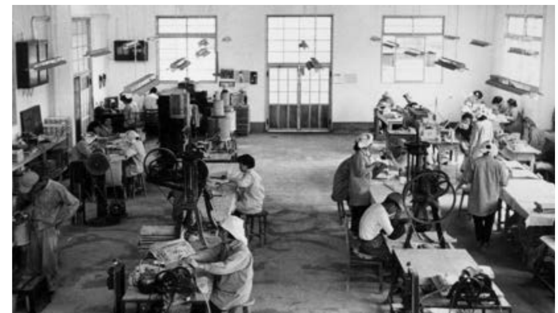
A base materials plant (the Takasaki Plant) in about 1957