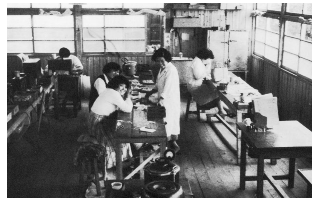
Murota Plant in the early days of its establishment