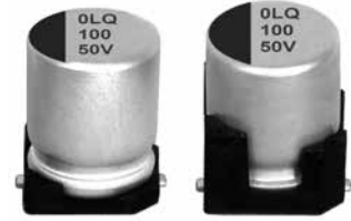
Marking color : Blue print