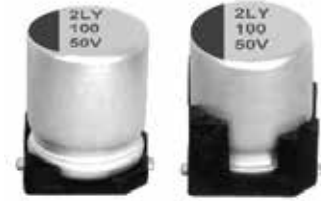
Marking color : Blue print